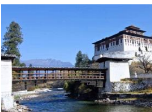
Punakha 📍 🚗 127km - ⌚ 3h 30m Paro 📍