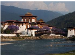
Thimphu 📍 🚗 77km - ⌚ 3h Punakha 📍