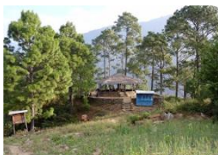
Jangbi Village 📍