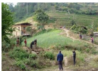
Tongtongphey 📍 9km - ⌚ 4h Jangbi Village 📍