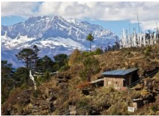
Korphu Village 📍 12km - 🕒 5h Nimshong Village 📍