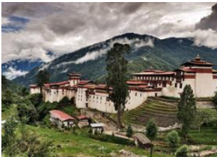
Nimshong Village 📍 2km - 🕒 2h Reutala 📍 🚗 58km - 🕒 2h Trongsa 📍

Day 6. You are likely to see Herons, River-lapwings and even Golden Languors in this region.