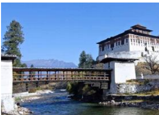
Punakha 📍 🚗 137km - ⌚ 4h Paro 📍