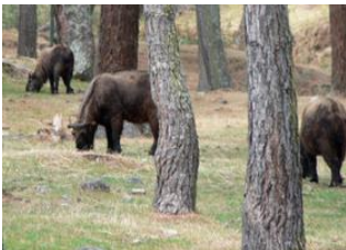
Phajoding 📍 5km - ⌚ 3h Mothithang 📍