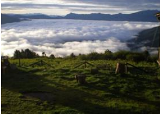
Simkotra Tsho 📍 10km - ⌚ 3h 40m Phajoding 📍