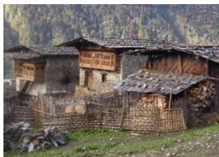
Damnongchu 📍 14km - ⌚ 5h Merak 📍