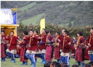
Miksateng 📍 4km - ⌚ 5h Sakteng 📍