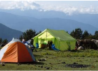
Sakteng 17km - ⌚ 7h Jyonkharteng