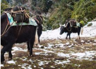
Merak 📍 16km - ⌚ 5h Miksateng 📍