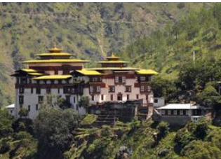
Jyonkharteng 12km - ⌚ 6h Phongmey 20km - ⌚ 30m Trashigang