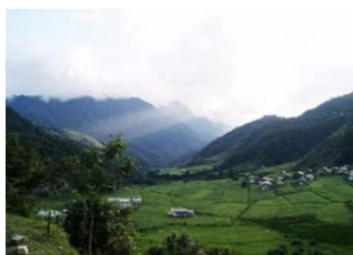
Chaling 📍 19km - ⌚ 8h Damnongchu 📍