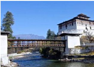
Thimphu 60km - 1h 12m Paro