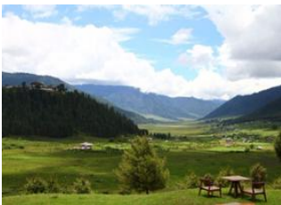
Bumthang 📍 🚗 188km - ⌚ 7h Phobjikha 📍