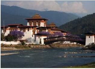
Thimphu 📍 🚗 77km - ⌚ 3h Punakha 📍