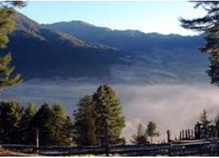
Lungsum 📍 15km - ⌚ 7h Tsochenchen 📍