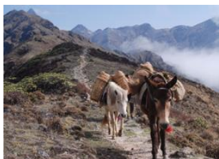
Duer Tsachu 📍 18km - ⌚ 9h Tsochenchen 📍