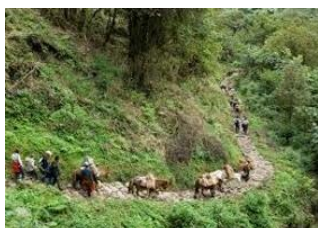
Gorsum 📍 12km - ⌚ 5h Lungsum 📍