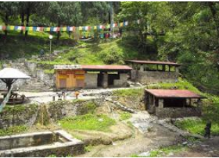
Tsochenchen 📍 18km - ⌚ 9h Duer Tsachu 📍