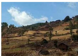
Duer 📍 18km - ⌚ 6h 30m Gorsum 📍