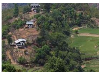
Tsochenchen 📍 15km - ⌚ 5h Lungsum 📍